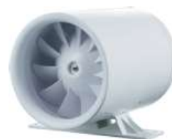
Ducto-U – fan with a fixing bracket for flat surface mounting